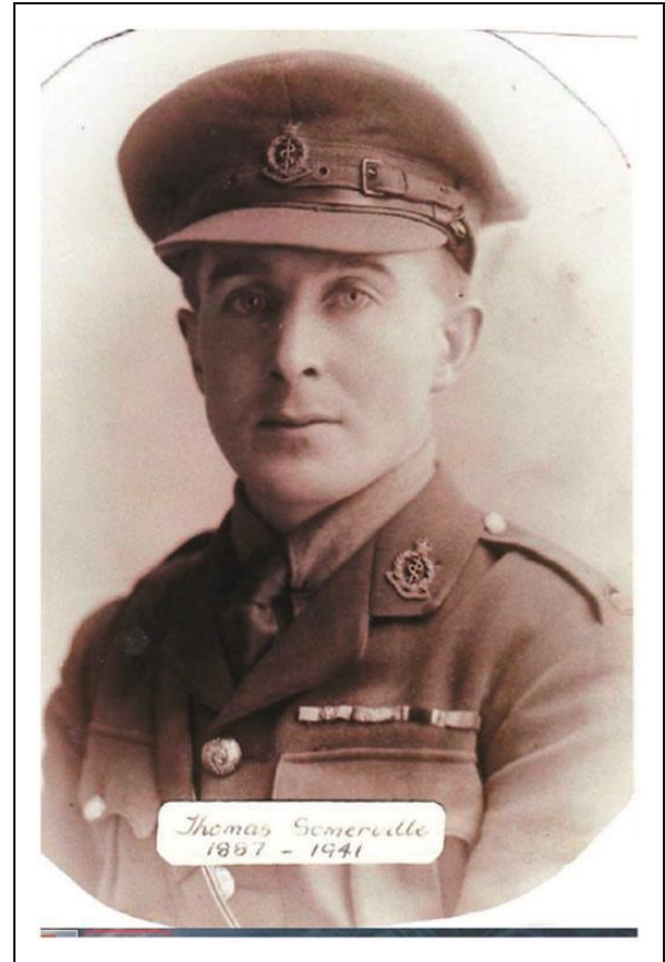
Figure 2. Captain TV Somerville in uniform of RAMC; First World War.

After the armistice, Somerville was sent to Murmansk in Northern Russia in March 1919, where he served