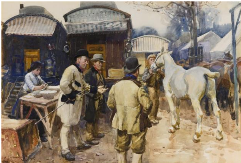
Munnings' The Horse Fair

Two pictures painted by Sir Alfred Munnings in the early 1900s before he became famous are set to fetch around half a million pounds when they are auctioned in America later this month.