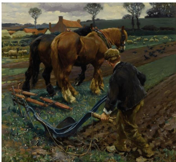
Munnings' The Plough In Early Spring

Munnings' 1901 oil painting The Plough In Early Spring is expected to sell for between $400,000-$600,000 (£325,000-£484,000) at the auction at Sotheby's in New York on November 22, while his 1905 watercolour The Horse Fair is likely to fetch between $125,000-$175,000 dollars (£100,000-£140,000).